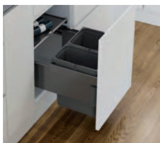
500 mm cabinet - 2 bins