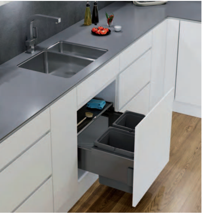
VS ENVI Space S 600 mm with 2x 15.5 litre bins