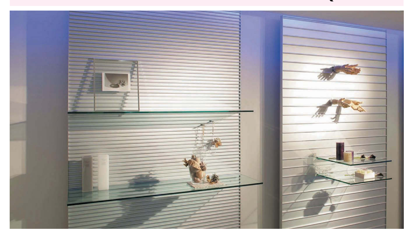
Installation Example Ceiling Height (CH): 2800mm