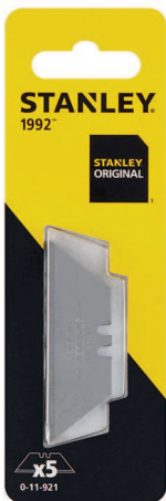
Pack of 5 blades