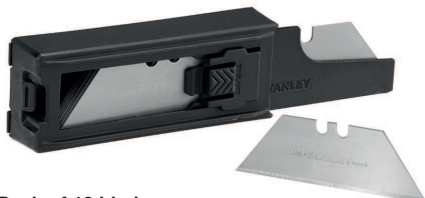
Pack of 10 blades