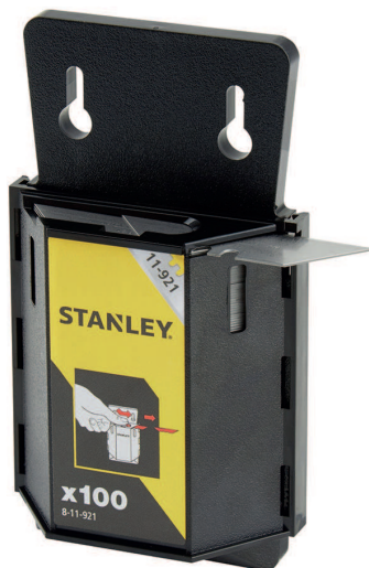
Pack of 100 blades