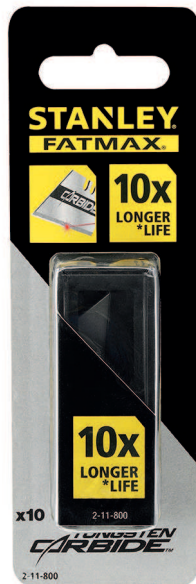
Pack of 10 blades