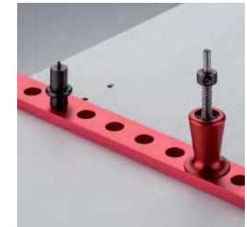
The drilling jig is moved and fixed wth the locating pin for longer rows of series drilled holes.