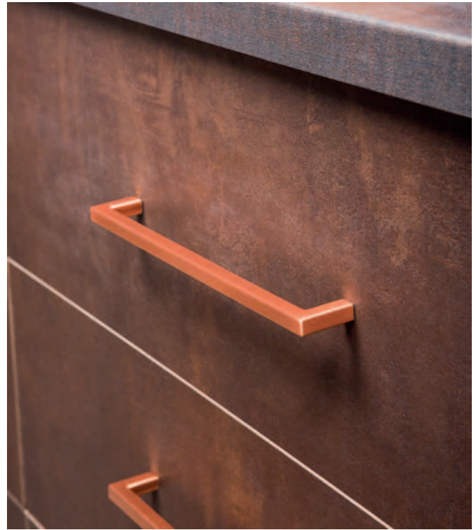
U pull handle