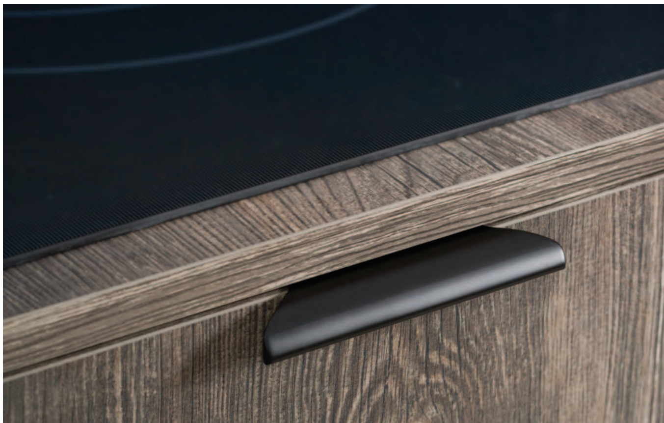
RITTA profile handle