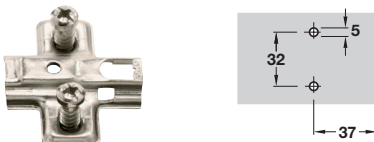
With pre-mounted Euro screws