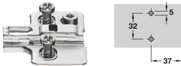
With pre-mounted Euro screws