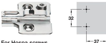
For Hospa screws