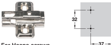
For Hospa screws