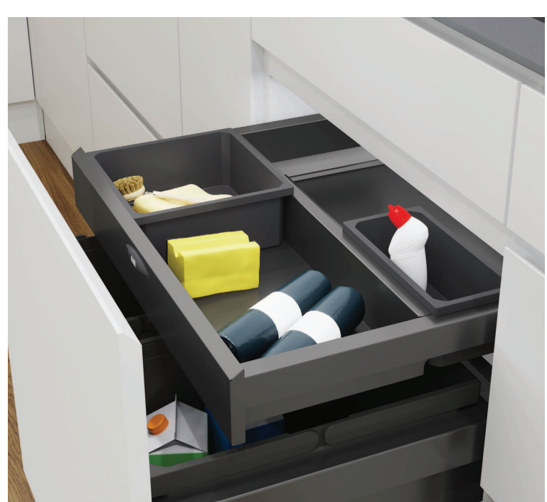
Lava grey finish VS ENVI drawer