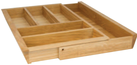
Photo shows European oak, 470 mm depth