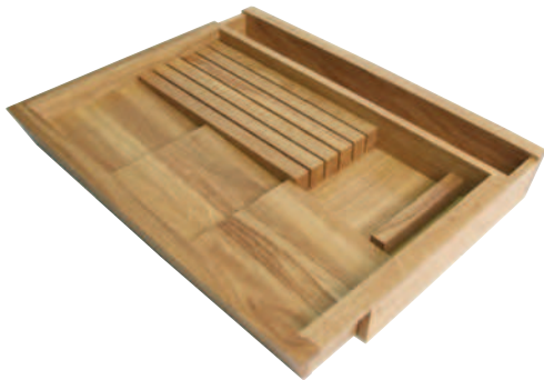
Photo shows European oak, 420 mm depth