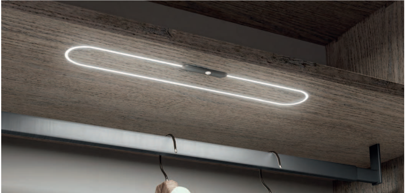
Loox Compatible 12V FLEXYLED SE H4 PIR flexible strip light, 4 mm, IP44 rated

A flexible linear side emitting LED profile. Installed by pressing into a groove just 4 mm wide flush to the panel and has built-in infrared sensor which automatically switches on the connected lights when it detects movement or variation in temperature