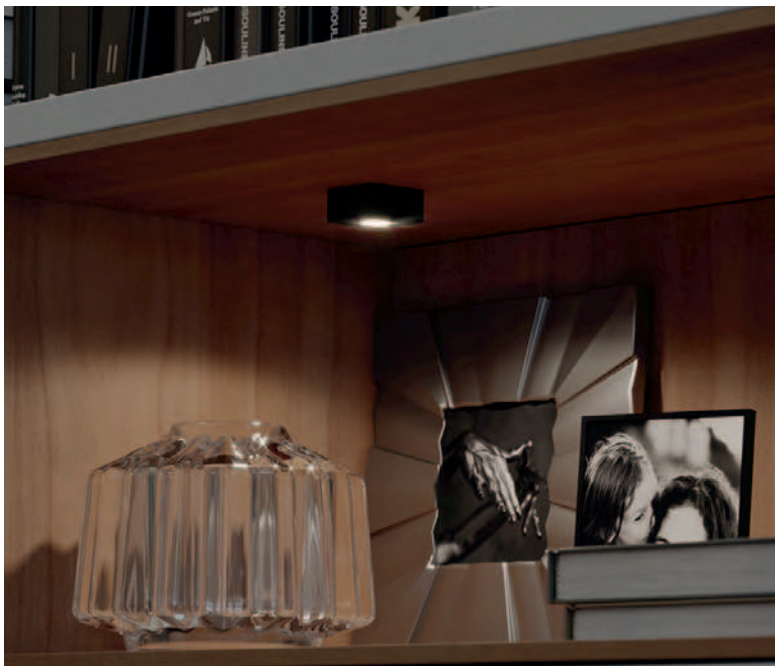
Loox 12V LED 2090 downlight, Ø 32.5 mm