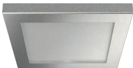
Loox5 12V LED 2081 RGB colour change downlight, 65 mm