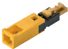
12V: Loox5 socket/Loox plug