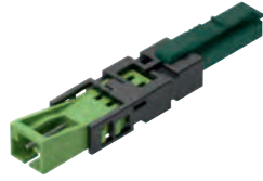
24V: Loox socket/Loox5 plug