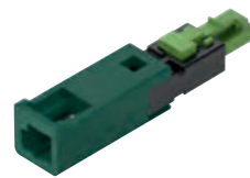
24V: Loox5 socket/Loox plug