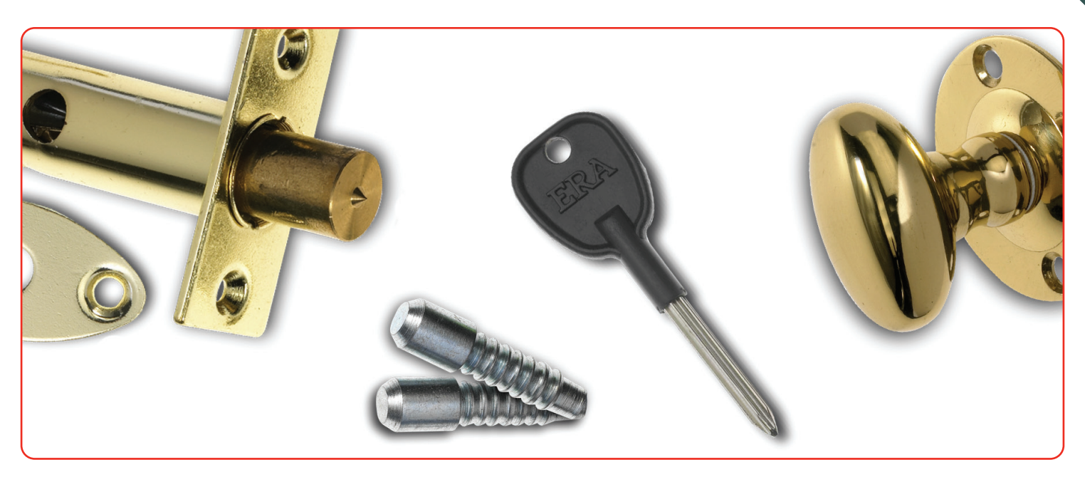
Door Security Bolt